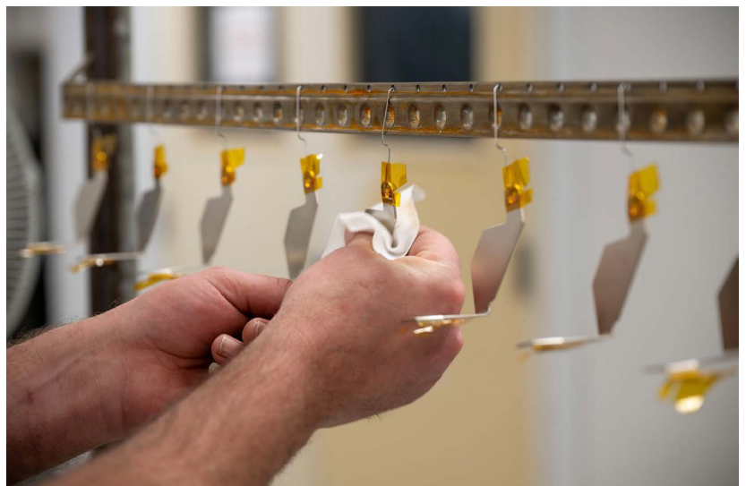
3. Cleanliness is key at all stages of production. Parts are cleaned at multiple stages within the process to ensure a quality part.

Another major engineering advantage of epoxy powders is the ability to strip and reapply the solution. This is critical because tight tolerances might require multiple coat/measure cycles, while damage during installation can be repaired and older assemblies can be refurbished instead of scrapped. For engineers working with specific dielectric targets, film thickness is an important variable that benefits from epoxy-based solutions as additional coats can be added after the initial application.