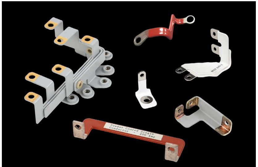
1. Busbars come in a variety of shapes, sizes, colors, conductor materials, and plating options. Here are examples of both multi- and single-conductor busbars.

As designs increase in power density and complexity, the insulating material around the busbar becomes a critical en-