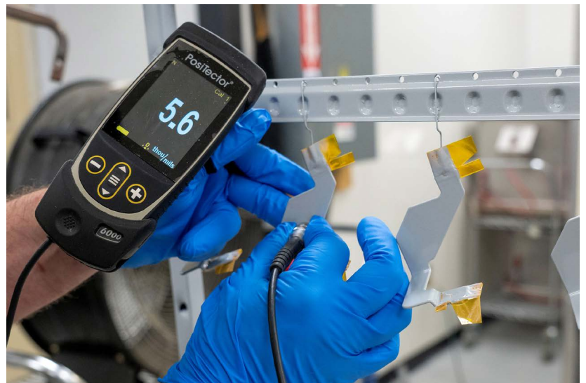
5. This is an example of a multi-conductor busbar that's been powder-coated using the fluidized bed method. With its heavy-gauge copper construction and thick powder coating, it's a very robust busbar with multiple termination options.

Highly automated facilities often struggle with irregular or unique shapes. That's why manual masking remains the most reliable method for complex or low-volume projects,