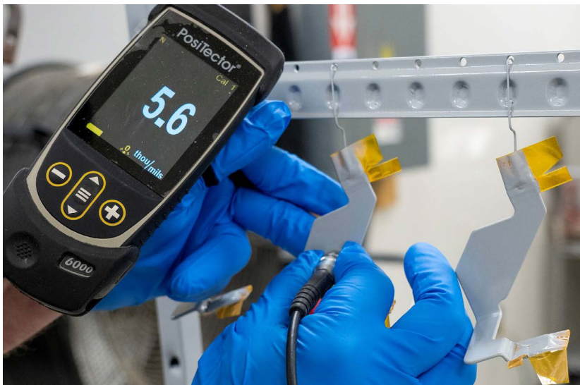
6. Every single part is measured and checked at multiple stages during the manufacturing process. This ensures strict adherence to specifications and quality standards.

When it comes to environmental conditions, manufacturers should rely on the powder suppliers' technical data-