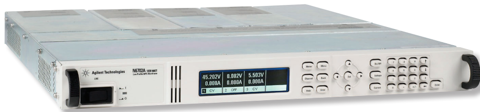
2. The Agilent N6700 modular power system offers one to four outputs in 1U of rack space. There are 34 power supply modules to choose from at up to 500 W per output.

Providing ac or dc into the PXI dc power supply card does overcome the limited power available from the PXI mainframe's backplane power supply, but this approach has its