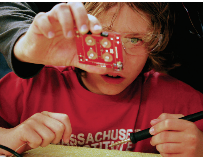
3. Even a child can build kits from SparkFun. Soldering is an easily learned skill.

A poorly executed step-by-step manual is a prescription for disaster for any kit company. If the customer can't build the kit successfully without massive telephone and mail support, the company would die a quick death, and many did. Heathkit figured this out early and spent as much development time on the manual as it did engineering the product. Its primary marketing message was "We won't let you fail," and the company lived up to it.