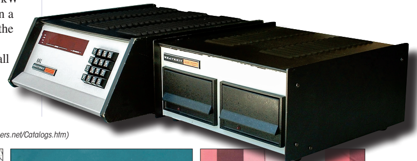
1. Many engineers and hobbyists alike eagerly anticipated the arrival of the new Heathkit catalog in the mail.

2. Heathkit’s popular computer kits included the H8, which offered the H-17 dual-floppy option.